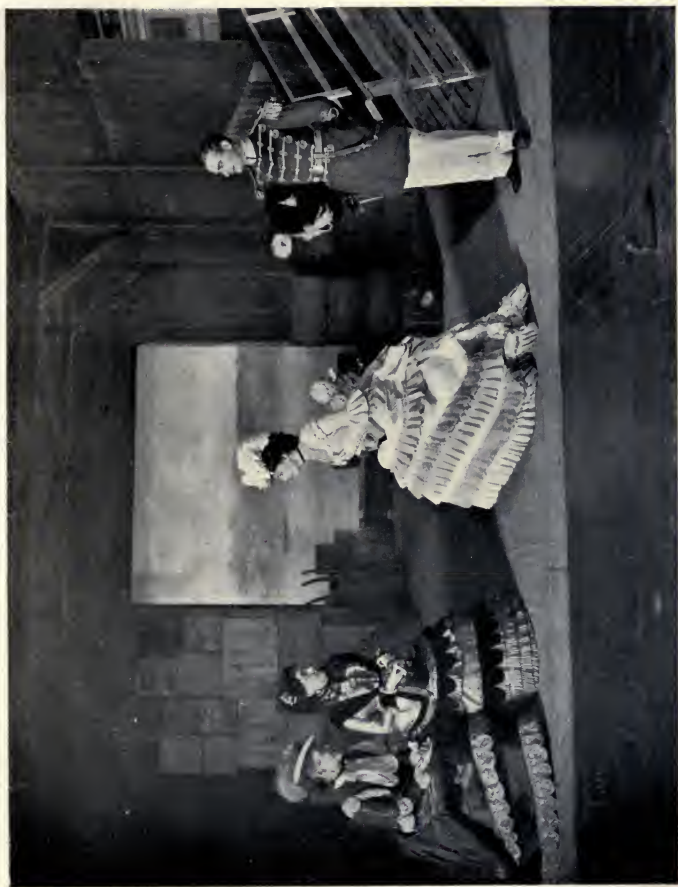
Mrs. STONINGTON. I am told the heroine is a — young person — no better than she should be, in fact not so good.